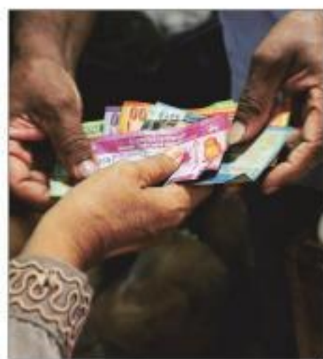
REUTERS PRESS TRUST OF INDIA Colombo, July 30

SRI LANKA'S INFLATION surged to 60.8% in July, up from 54.6% in June, the crisis-hit country's statistics department said on Saturday, as food and fuel remained scarce amid depleted foreign exchange reserves.